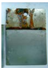
Protected by Zerust VCI Tape for 48 hours