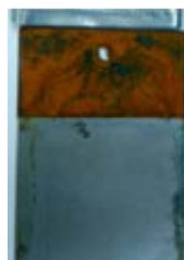
Protected by Zerust VCI Tape for 96 hours