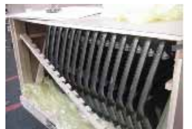
Steel automotive parts protected by Zerust ICT-510 VCI Film arrive free of corrosion