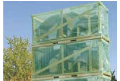
CKD kits are shipped from Russia to Ecuador corrosion free using Zerust ICT-510 VCI Bags

The automaker saved $858,000 per year on corrosion and labor costs by using Zerust Corrosion Inhibiting VCI Films.