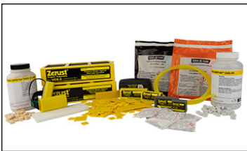
ZERUST® VCI Vapor Diffusers