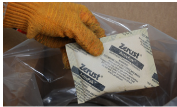
ZERUST® Fast-Acting ActivPak®