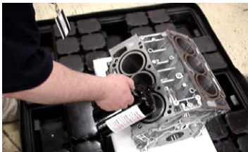
ZERUST® VCI Oil Spray-On RP