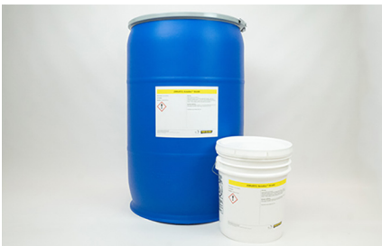
Targeted void space protection with ZERUST® corrosion inhibitors.