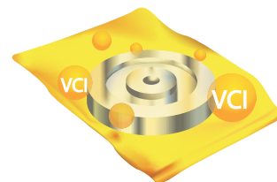
Illustration of VCI molecules enclosed in a ZERUST® VCI bag.

On the left: competitor VCI oil protection; on the right: ZERUST® Axxanol™ 750 VCI Oil. Results after 24 hours in ASTM B117 salt-spray testing.